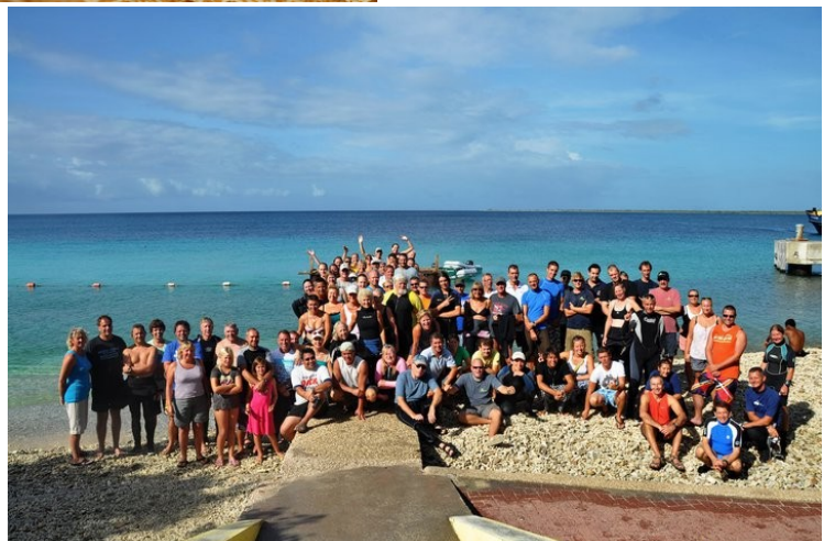
We're all Dive Friends!

For more information, questions, comments, or anything else, please feel free to contact us. We will do our utmost to answer your mails as quickly as possible.